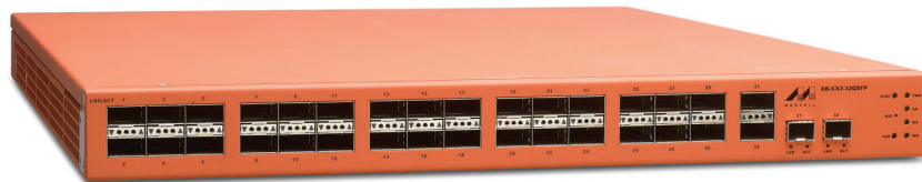
Marvell Prestera 98CX8297: 32 port QSFP Reference Design

To shorten system manufacturers design cycles and accelerate time-to-market, Marvell provides complete development platforms and reference designs with, schematics, layout files and related documentation.