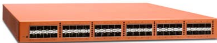
Fig 2. RD-CX-48XG - Prestera CX 48 port 10GbE (SFP+) Reference Design

To shorten system manufacturer design cycles and accelerate time-to-market, Marvell provides complete Prestera CX development platforms and reference designs with device drivers, schematics, layout files and other documentation. Software and hardware solutions based on the Prestera CX platform are available from third-party vendors.