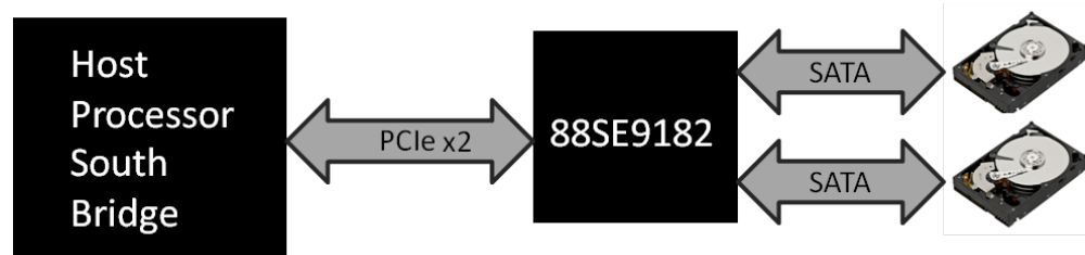
Fig 2. Typical Two Disk Application Example of 88SE9182

The small footprint of the device and the very few required external components occupy a minimal amount of board space, easing system design and reducing cost. The devices are available with optional industrial and automotive temperature grade certification opening up a broad range of applications requiring flexible storage solutions in harsh environments.