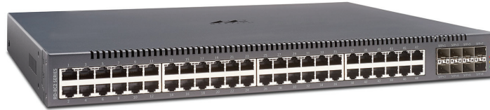
Fig 2. Reference Design

To shorten system manufacturers' design cycles and accelerate time to market, Marvell provides complete development platforms and reference designs with schematics, layout files and related documentation.