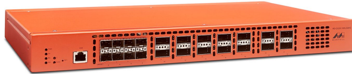
Fig 2. Reference Design

To shorten system manufacturers' design cycles and accelerate time to market, Marvell provides complete development platforms and reference designs with schematics, layout files and related documentation.