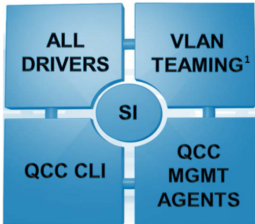
Figure 3. Components of SuperInstaller (SI)