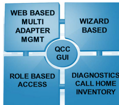
Figure 1. Key Features of the QCC GUI