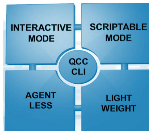
Figure 2. Key Features of the QCC CLI

QCC CLI provides a lightweight, text-based interface for managing generations of QLogic Fibre Channel adapters from Marvell. Restricted to local mode adapter management for enhanced security, the QCC CLI provides both interactive modes for IT administrators who are unfamiliar with the syntax and a scriptable mode with a rich set of commands and options for scripting. QCC CLI is available for Windows, Linux, and Solaris environments and is available as a standalone package for installation, or it can be installed as part of the SI.