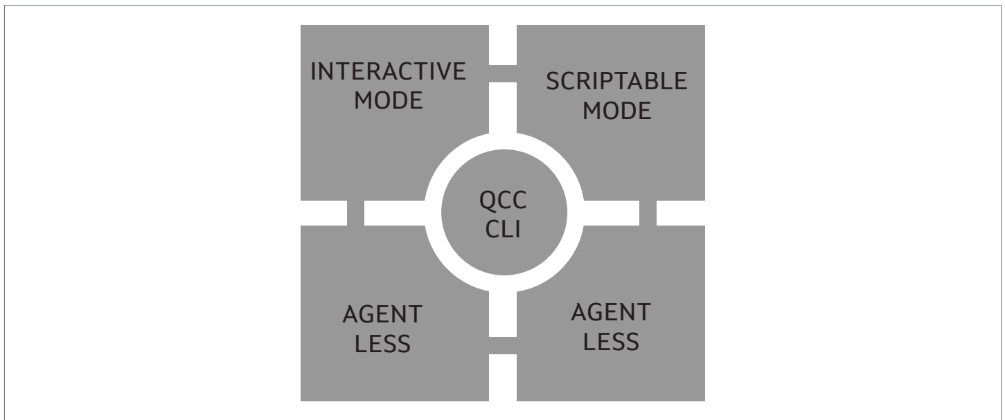
Figure 2. Key Features of the QCC CLI

QCC CLI provides a lightweight, text-based interface for managing generations of Marvell QLogic 2500/2600/2700 FC HBAs, Marvell 3200 IEAs, and Marvell 8100/8200/8300 CNAs. Restricted to local mode adapter management for enhanced security, the QCC CLI provides both interactive modes for IT administrators who are unfamiliar with the syntax and a scriptable mode with a rich set of commands and options for scripting. QCC CLI is available for Windows, Linux, and Solaris environments and is available as a standalone package for installation, or it can be installed as part of the SI.