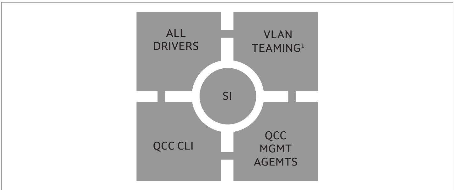
Figure 3. Components of SuperInstaller (SI)