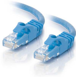
Figure 1. Low-cost CAT6A Cabling

*Source: Internet Price from CDW.COM for OEM-branded/supported products