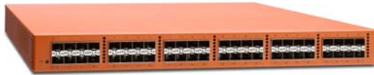
Fig 2. RD-CX-48XG - Prestera CX 48 port 10GbE (SFP+) Reference Design

To shorten system manufacturer design cycles and accelerate time-to-market, Marvell provides complete Prestera CX development platforms and reference designs with device drivers, schematics, layout files and other documentation. Software and hardware solutions based on the Prestera CX platform are available from third-party vendors.