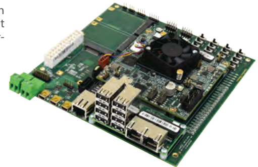
COM Express Development Platform

The OCTEON III CN70XX/CN71XX families of multi-core cnMIPS64 processors integrate single to quad cnMIPS64 v3 cores with virtualization capabilities and hypervisor support. These highly-integrated SoCs include a rich set of I/O's and Cavium's advanced hardware acceleration for packet processing, security, deep packet inspection (DPI), offering a power, performance, and price-optimized solution for next-generation platforms.