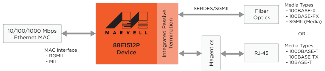
Figure 1: RGMII to Copper/Fiber/RGMII Auto-media Application