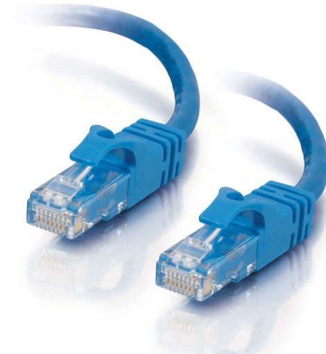
Figure 1. Low-cost CAT6A Cabling